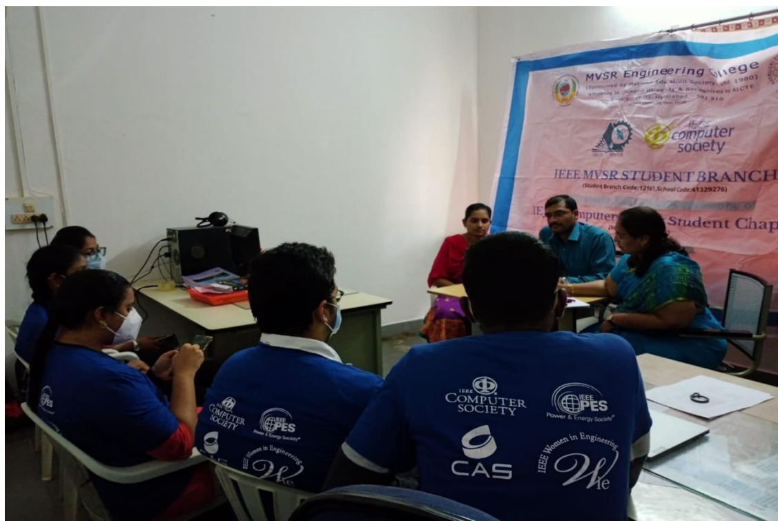
Commencement of Meeting